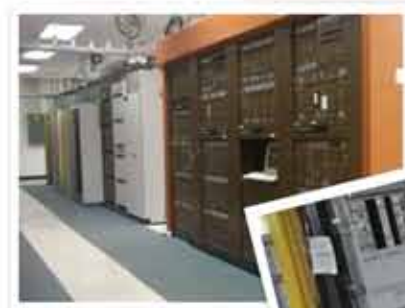
Certified refurbished equipment