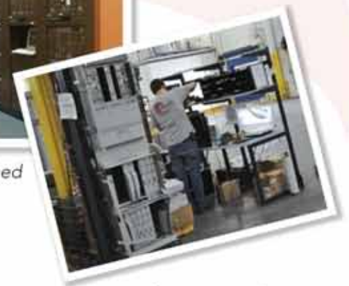
Remanufacturing and recertification

"We had a great experience doing business with Phoenix Telecom during the last year, so I look forward to continue working with you."